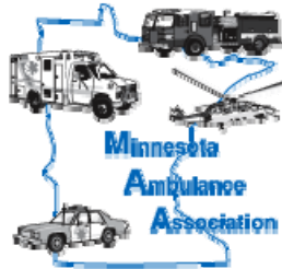
Representing Minnesota's EMS Professionals